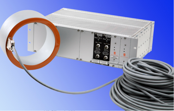
NPCT with 175-mm sensor head